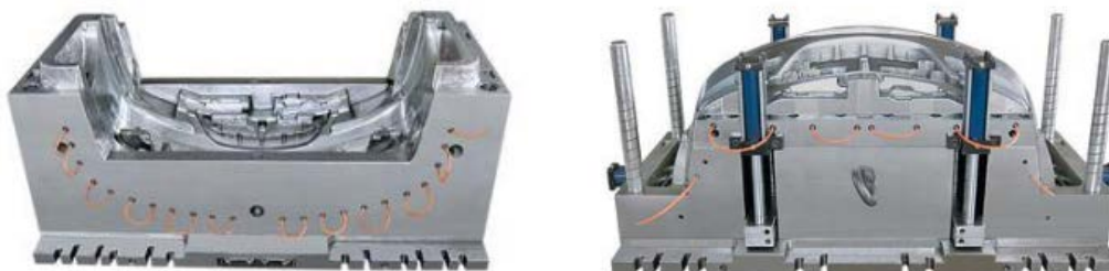
Figure 2. 3D printing car cooling plastic mold

The traditional automotive cooling plastic mold design and manufacturing process is mainly based on CAD software design, assembly and commissioning according to the designed components. This process is time-consuming and costly, and if the design is defective, it will cause great losses. With the gradual maturity of 3D printing technology, the reverse engineering concept changes the processing mode of traditional automotive cooling plastic molds, and by using its significant advantages in complex structural models, it can solve the difficult problem of processing complex plastics in automotive cooling plastic mold processing. The use of 3D printing technology has reduced the design process in the process of manufacturing automotive cooling plastic molds, and improved the time for product replacement. The 3D printing automotive cooling plastic mold is shown in Figure 2.